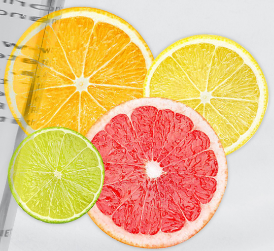
Citrus Essential Oil

A makeup remover that cleanse dirt, keeps skin plump, hydrates and brightens the skin. It also helps in restoring moisture levels.